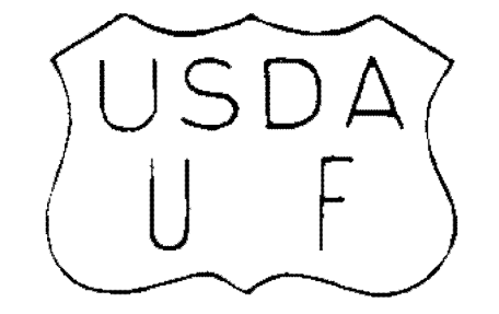
Figure 1 to Paragraph (a). Preliminary Grademark.

■ 15. Revise § 54.16 to read as follows: