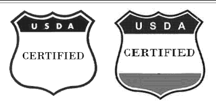
Figure 11 to paragraph (j). USDA Certified Mark.

(k) The following, as shown in Figure 12 to paragraph (k), constitutes official identification to show product or services produced under an approved USDA Further Processing Certification Program (FPCP):