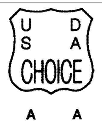
Figure 6 to paragraph (f). Official Quality Grade Identification Mark.

(g) The letters "USDA" with the appropriate grade designation "1," "2," "3," "4," "Utility," enclosed in a shield as shown in Figure 7 to paragraph (g),